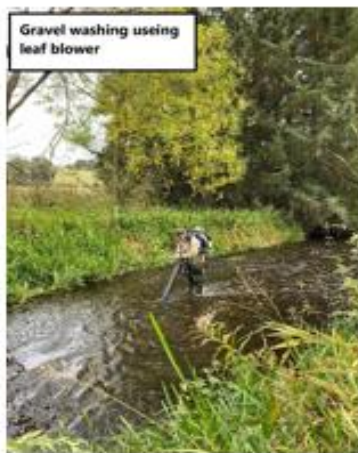
Fig 1. Gravel Washing by Leaf Blower

Once the first initial stage of slackening off the compacted gravel is complete, the use of a leaf blower brings excellent results, in removing sediment deposits from the spawning substrate.